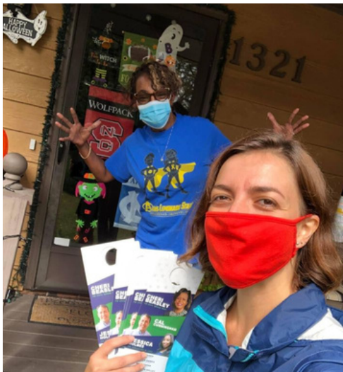
Durham For All volunteers doing social-distanced doorknocking