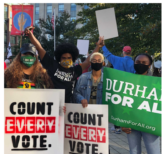
D4A members at our Nov. 4th rally in Durham

This was an unprecedented election, with millions of Americans voting by mail while our sitting president cast doubt on the results and tried to bully and cheat his way to a victory he could not win. In the aftermath of the election, Durham For All worked with allies across the state to celebrate democracy and protect our votes. On November 4th, we mobilized in Durham, and on November 7th and 14th we joined broader statewide rallies in Raleigh. Together, we fought back against right-wing attempts at disenfranchisement by bringing thousands of people together to insist that we count every vote.