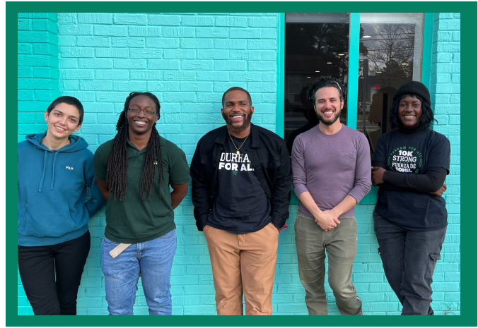
2023 D4A staff team