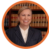
Lucy Inman NC Supreme Court