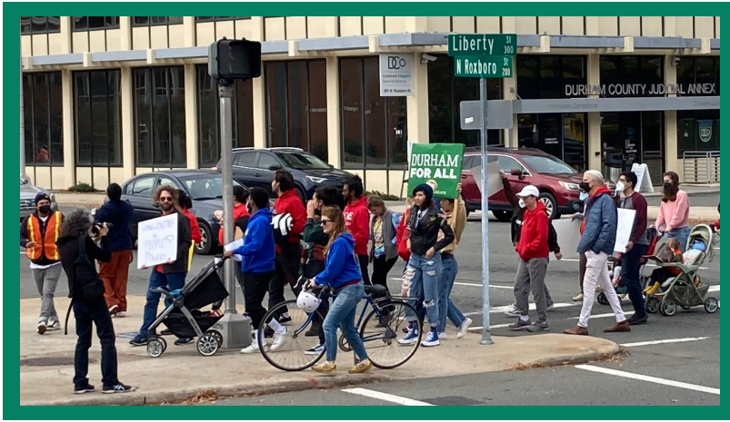
Oct. 29th Power to the Polls rally and march