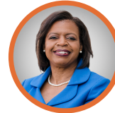
Cheri Beasley U.S. Senate