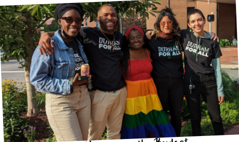
City Council Public Hearing on the Budget