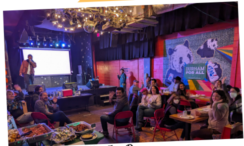
End of Year Party: The Get Down